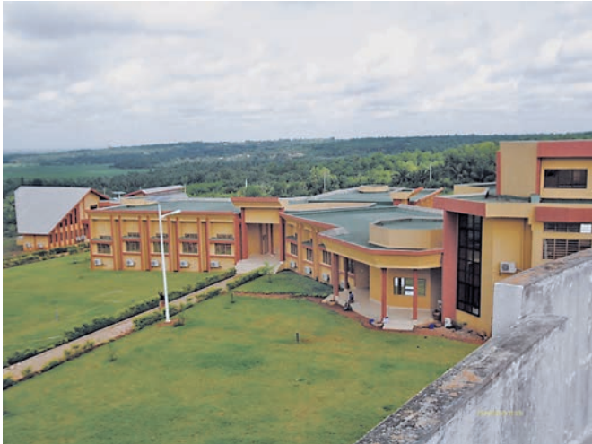
Figure 1: Pictured here is the Institut de Mathématiques et Sciences Physique (IMSP) in Benin. A small graduate school in mathematics that recruits students from all over Africa, IMSP recently won a World Bank award to host a “center of excellence.”

of Botswana, University of Dakar, Universities of Yaounde and Dschang in Cameroon, University of Niamey in Niger, and University of Congo-Brazzaville. I have also visited AIMS Senegal, where I gave lectures and seminars and directed master's theses.